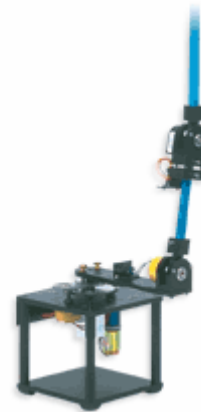
(f) double rotary inverted pendulum