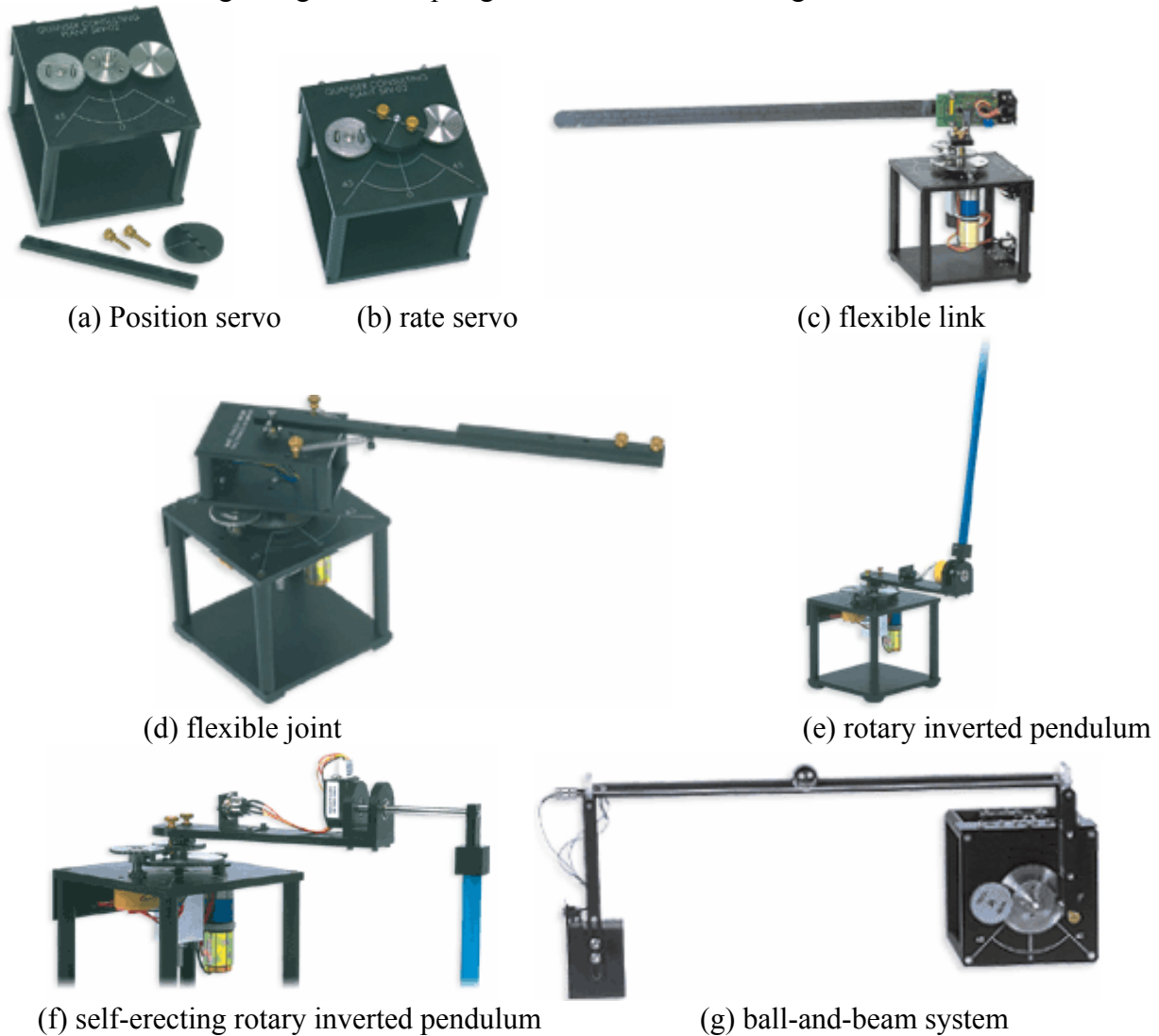
Figure 1. Quanser rotary family mechatronic plants

“ Mechatronics Lab ” was built on top of the existing “ Controls Lab ” (EL112). In this lab, mainly for undergraduate and graduate teaching purposes, there are 5 stations each equipped with a Quanser real time hardware-in-the-loop simulation system (Quanser MultiQ board + terminal board + SRV-ET DC motor + power amplifier). A whole family of Quanser Rotary Plants was purchased in the beginning of 2003 spring semester as shown in Figure 1.