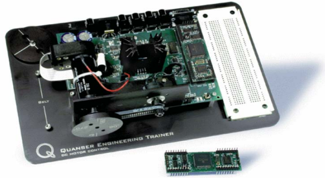
(b) QET Engineering Training Kit