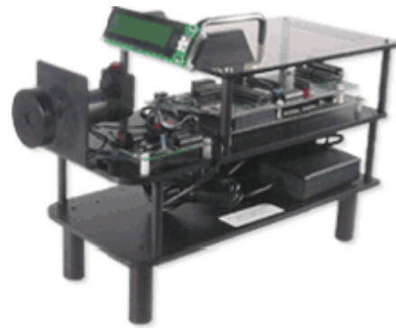
(d) Mechatronic Control Kit