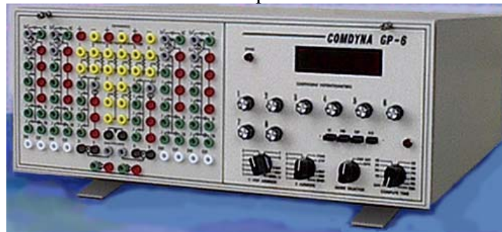
Figure 3. GP-6 analog computer ( http://www.comdyna.com/gp6intro.htm )